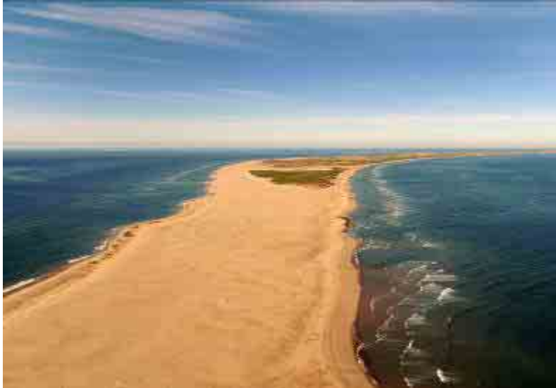
Figure 3 – Aerial View of Sable Island

The 2008 Study of Tropospheric Ozone on Sable Island was sponsored by the Sable owners. During April and June - July 2008 two intensive series of vertical profile ozone measurements were made at Sable Island and at 12 other Canadian locations in conjunction with the ARCTAS campaigns. Additional ozonesonde launches were conducted at sites in Alaska and the lower USA, and in Greenland. The organization of this transcontinental network was similar to that of the very successful 2004 and 2006 programs (IONS 2004 and IONS 2006), and used the acronym ARCIONS ( Arctic Intensive Ozonesonde Network Study ).