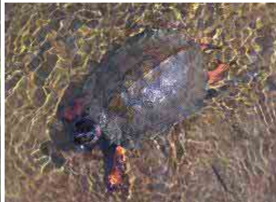
Figure 5 - Wood turtle