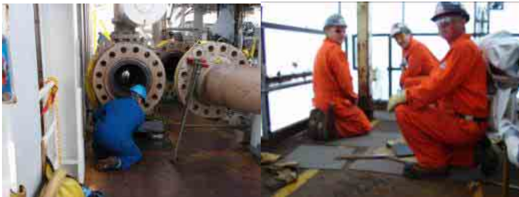
Figure 1 – Local Tradesmen working on Facilities

In 2008, no new project development work occurred. ExxonMobil continued with work started in 2007 on a coatings program for the Thebaud and Venture Platforms. Local coatings contractor Parker Aluma, through Amec Black and MacDonald, was awarded the contract for this work. Parker Aluma completed the majority of scheduled Thebaud work and Venture work to escape routes on the platforms. This was a successful and significant undertaking in view of local weather and work restrictions on this type of work offshore.