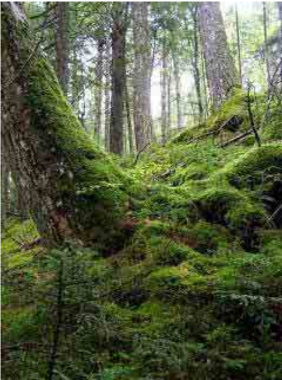
Figure 4 - Hemlock and spruce forest

Atlantic salmon, a species imperiled throughout its Atlantic range, wood turtles, a species-at-risk in Canada, and numerous rare floodplain plants.